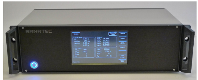
Ranatec RI 241 is a modular, multi-channel Fading Emulator suitable for radio link testing in laboratory environment.